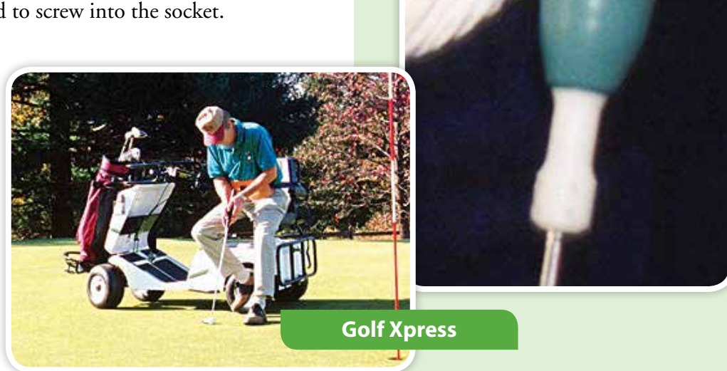
More information: golfxpress.com

The Golf Xpress is a single-rider golf cart for those with limited mobility that goes everywhere the golfer goes - onto the tees, into the traps and even onto the greens. It runs on rechargeable batteries and has an adjustable restraint system and a wraparound handrail for quick seat positioning, easy transfers on and off the cart, and stability for one-handed swings.