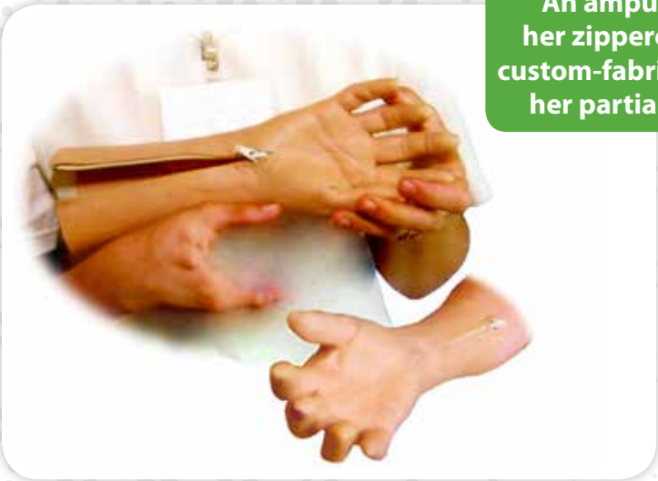
An amputee demonstrates her zippered glove which was custom-fabricated specifically for her partial hand amputation