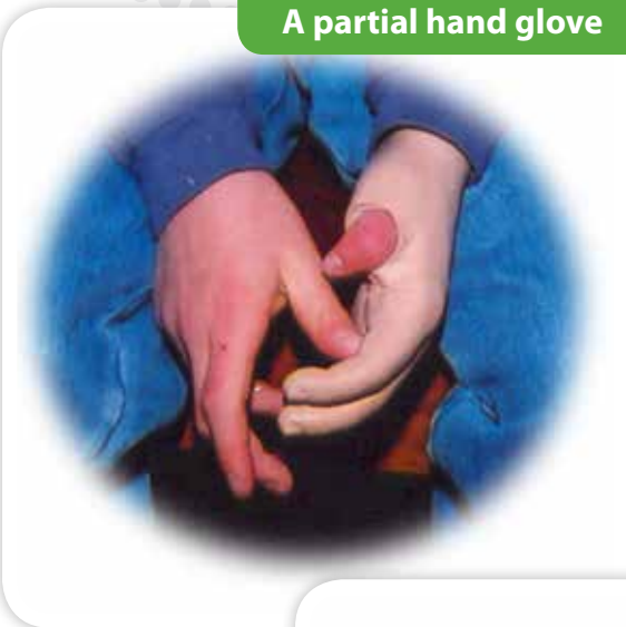
A partial hand glove