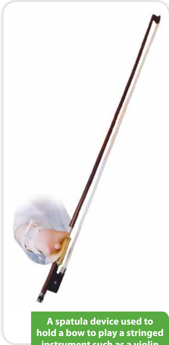
A spatula device used to hold a bow to play a stringed instrument such as a violin