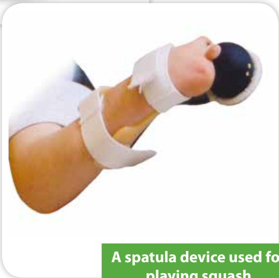
A spatula device used for playing squash