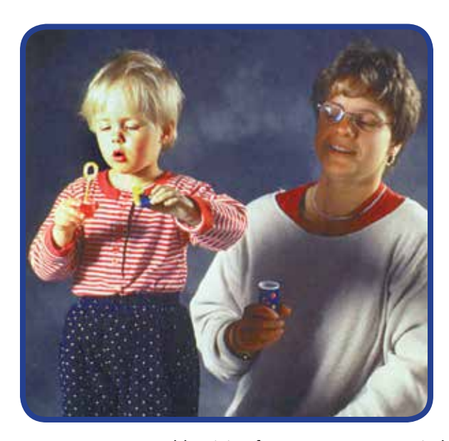
Healthy Living for Amputees: Upper Limb • 1

When it comes to upper limb prostheses, amputees need to see that the prosthesis is providing actual functional benefit to them, or else they will not perceive any value in wearing a prosthesis and they will reject the fitting. This is different for users of artificial legs because the benefit of walking with a lower limb prosthesis – to get you from point A to point B – is obvious. This is not necessarily the case with upper limb prostheses right away. For some, who like to wear a prosthesis primarily for cosmetic reasons, the functional aspect will not be as imperative. However, young children do need to have that sense of the device actually being useful to them.